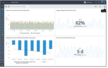
Gain real-time insights with reports and dashboards