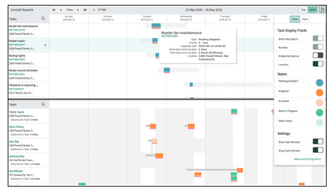
Assign work interactively with Central Dispatch